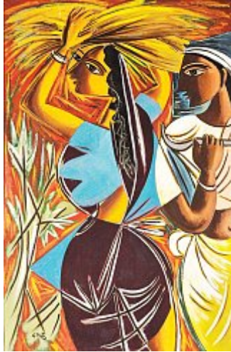
The Reapers (1960). George Keyt. Oil on Canvas. 136 x 87 cm. Taprobane Collection

century, the worst kind of Victorian naturalism became the goal of artistic accomplishment.