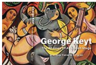
Dustjacket of Book

Modernism appealed to Keyt's temperament, liberating him as a man and an artist. Confined and stifled by the morals and conventions of the day, he had already broken with its social codes. Modern art and its innovation opened up a new path for him. Enabling him to be free, to be different and to be himself, it gave him the tools to interpret the new world and the new life he had carved out for himself.