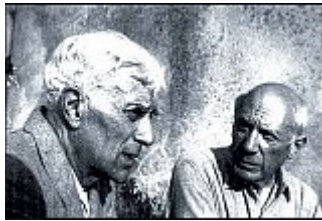
Georges Braques and Pablo Picasso