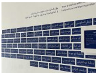
The names of artists from Gaza whose work is on display at "This is Not an Exhibition" in the Palestinian Museum, Birzeit, occupied West Bank.