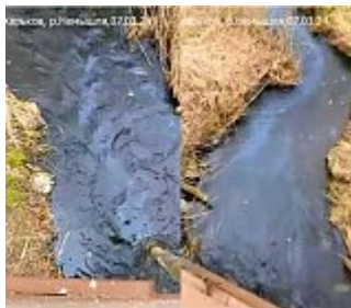
Poisoned rivers and springs of Kharkiv