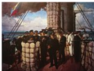
Painting of Admiral Togo on the Bridge of the Japanese Battleship Mikasa before the Battle of Tsushima in 1905