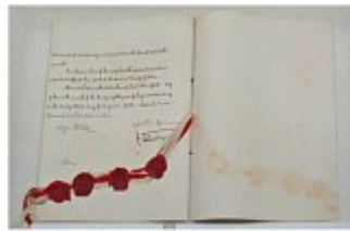
Japanese-Russian Peace Treaty Signed on September 5, 1905

The reason for ignoring the impending danger may be that at the time Japanese policy followed a moderate course. In the first cabinet of Prince Saionji Kinmochi, Hayashi Tadasu served as foreign minister for most of the critical years 1906-08. His policy is dealt with by Y. Teramoto in Nichi-Ro sensō . Hayashi is characterized as an exception among the Japanese policy makers of his time in that he advocated reasonable and rational ideas, including the fair treatment of China. As a former minister and later ambassador to London, he struggled to continue a policy of close cooperation with Great Britain and the US, despite potential tensions. Furthermore, he aimed at preventing Japan's isolation by seeking better relations with France and Russia. The policy towards the Asian continent, however, was in contradiction to these interests since Tōkyō attempted to tighten its grip on Manchuria. Hayashi's diplomacy became a difficult balancing act.