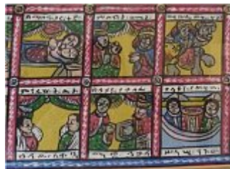
Comic style Ethiopian painting: King Solomon, the Queen of Sheba and their offspring Menelik

Emperor Haile Selassie clearly hoped to strengthen his prestige abroad by introducing constitutionalism and a parliamentary system, thereby securing the independence of his country. His reform policy following the Japanese model may be traced back to the admiration of his father, Ras (= Prince) Makonnen, the hero of Adua, who had looked up to the Tennō's empire after the victory over Russia proved that a non-European nation was equal to the West in culture and technology and could defy it.