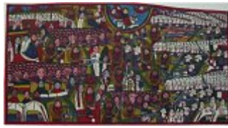
The battle of Adua 1896 in a traditional Ethiopian painting (Collection Krebs)