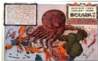
A Japanese propaganda map depicting Russia as the “black octopus”