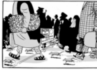
The Daily Mail , 2015.

As my colleague Lee Fang documented in 2015 [22], the prevailing rhetoric about Muslim refugees is identical to that used to demonize Jews during the World War II era. Indeed, the right-wing rag Daily Mail 's 2015 cartoon showing Muslim refugees as rats (top cartoon, below) perfectly tracked a 1939 cartoon in a Viennese newspaper depicting Jews the same way (bottom, below):